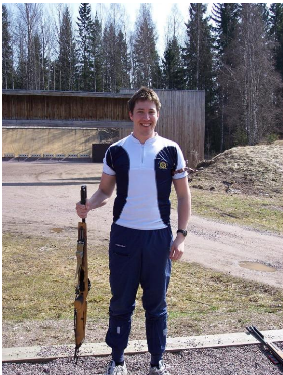
The only way of carrying the weapon at the shooting range

4) If the shooter does not fire ten (10) rounds, in each position, this will result in disqualification of the shooter from the competition.